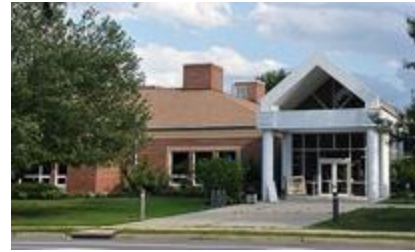
Sherwood Regional Library