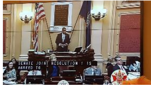
VA Senate Approval