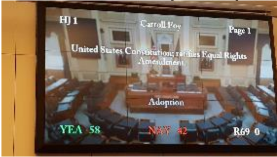
VA House Approval

bills were identical, the rules required the Senate to pass the House resolution and vice versa. This occurred on Monday, January 27.