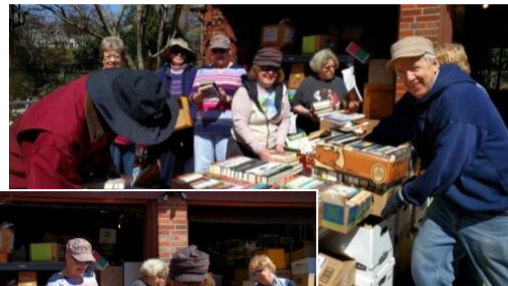
Book Sorting Fun on our one sunny day!