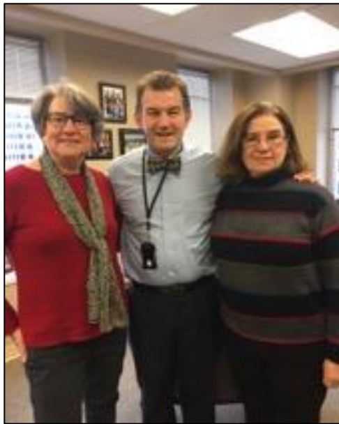
Leslie Manning and Aida Loomis meet with Senator Chap Peterson during AAUW of Virginia State Lobby Day

Leslie Manning and Aida Loomis meet with Senator Chap Peterson during AAUW of Virginia State Lobby Day. These priorities are ratification of the Equal Rights Amendment; equal pay legislation aimed at eliminating the gender pay gap; fair, nonpartisan legislative redistricting; paid sick leave; and measures to assist victims of human trafficking, especially minors.