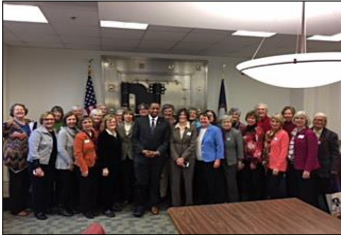
AAUW of Virginia members meet with Lieutenant Governor Justin Fairfax

Executive Order prohibiting state agencies and offices from asking job applicants for their past wage history. Such an action would ensure that state employees receive salaries that are commensurate with their skills, qualifications, and experience and is a step toward eliminating the gender pay gap. The Governor of New Jersey issued such an Executive Order in January, and AAUW's Vice President for Public Policy gave Governor Northam a copy, which he said he