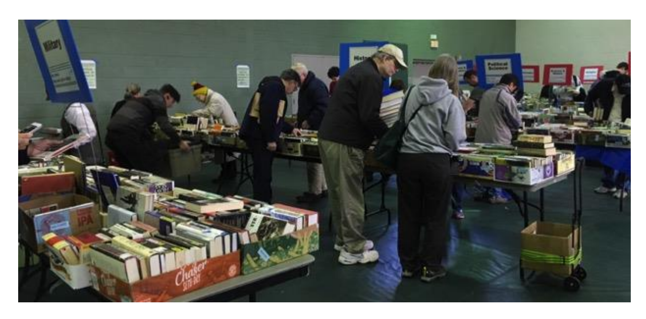
The pace was steady all day Friday and Saturday.