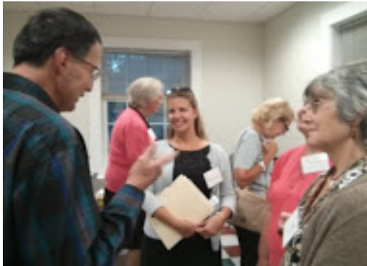
Falls Church Branch members enjoying conversation at the September 2015 Branch meeting!

Sources for some of the data showing the numbers of women in academic careers include http://www.nsf.gov/statistics/ . The report addressing diversity, Women, Minorities and Persons with Disabilities in Science and Engineering , is at http://www.nsf.gov/statistics/2015/nsf15311/ .