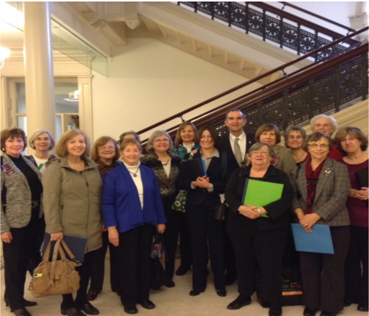
Lieutenant Governor Ralph Northam with AAUW of Virginia members