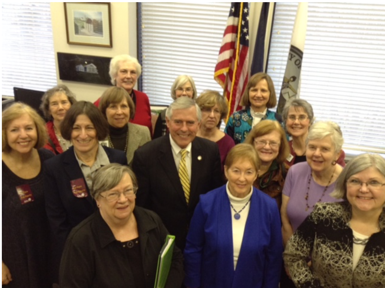
AAUW of Virginia members meet with Senator John Edwards