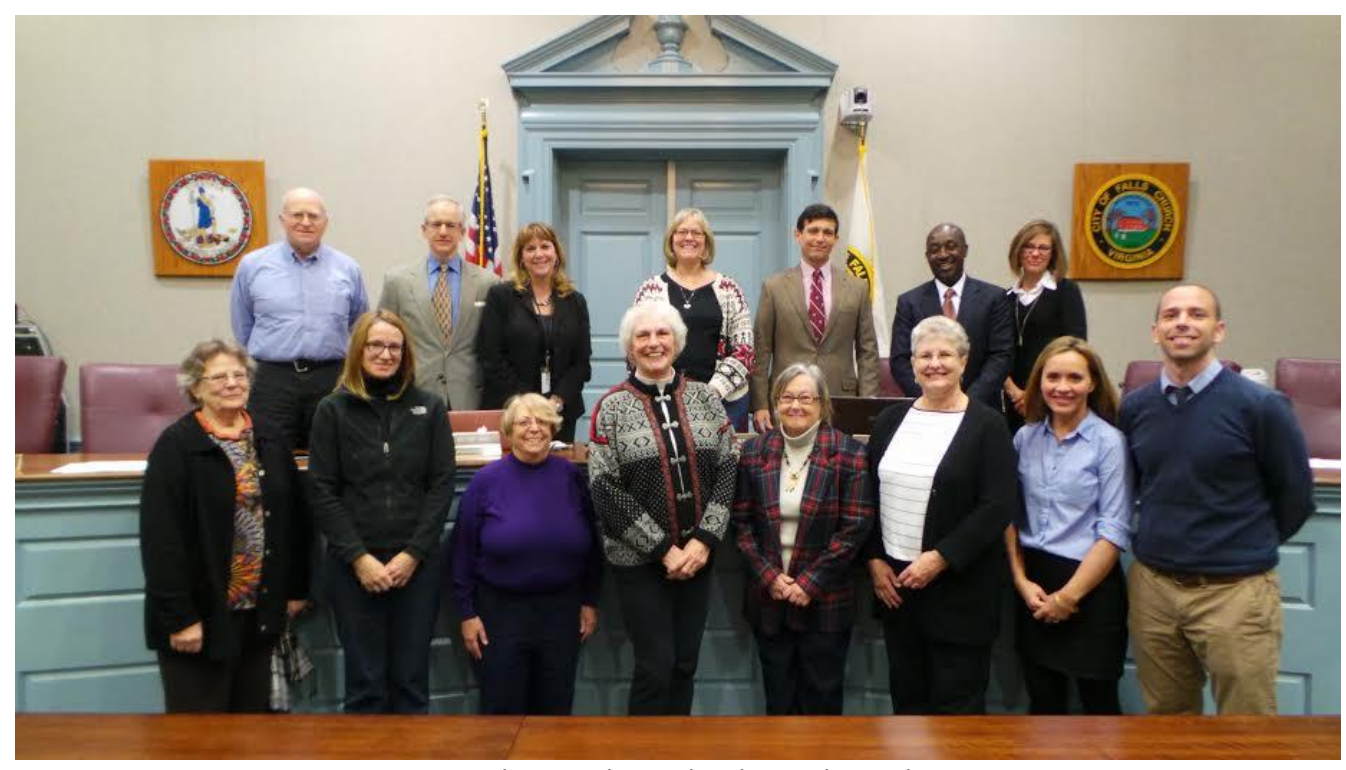
AAUWFC members and FC School Board members

The Computer Science Education Week resolution will draw attention to the importance of offering computer science education in all levels of our public school curriculum. The resolution will be announced in the School's Morning Announcements the week of December 8-14 and will be shared with teachers and administrators and the community.