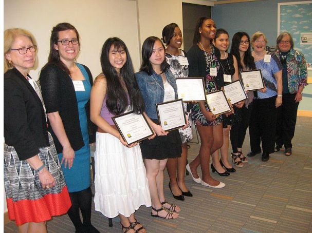
Photos from the Scholarship Meeting on May 11.