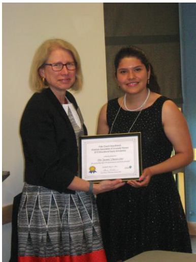
Additional Photos of the May 11 scholarship meeting