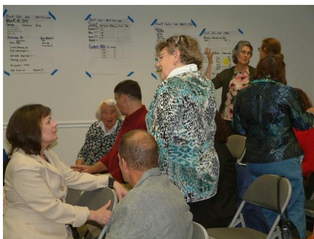
There is time for lively conversation before and after meetings!