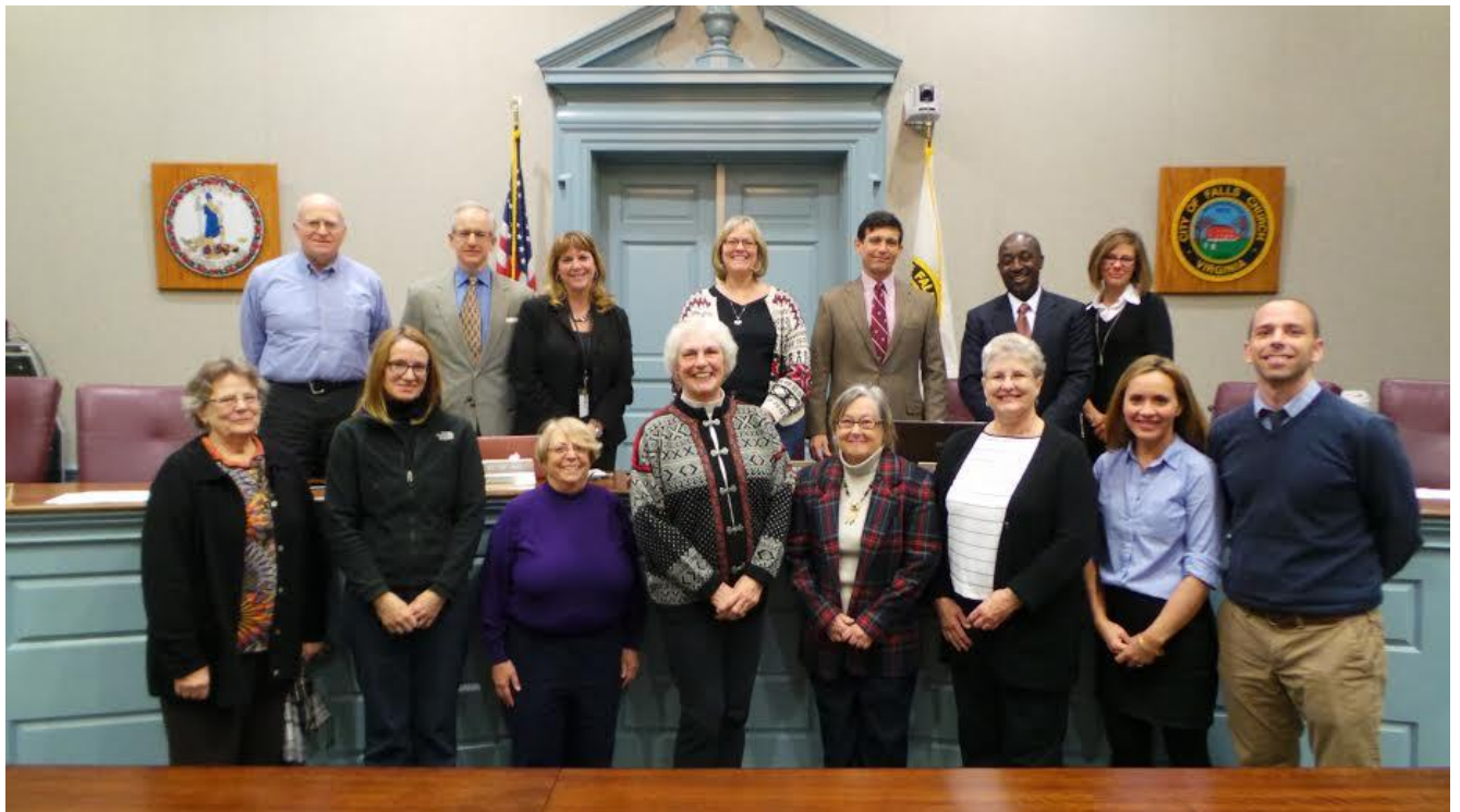
AAUWFC members and FC School Board members

The Computer Science Education Week resolution will draw attention to the importance of offering computer science education in all levels of our public school curriculum. The resolution will be announced in the School's Morning Announcements the week of December 8-14 and will be shared with teachers and administrators and the community.